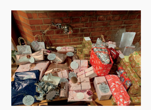
Hope Café (Launched in 2022)

We ended the year with Christmas presents and hampers allowing us to give out presents to 32 CAP households and their families, along with 12 'Christmas Lunch on Jesus' (CLOJ) Hampers. One client echoes that of many others: Thank you so much. Say thank you to everyone who is involved with the amazing Christmas box. I'm full of joy. Blessings and blessings to you and your family. I loved the gift too!'